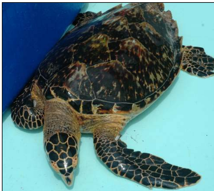
Hawksbill turtle showing flipper tag in anterior left flipper.